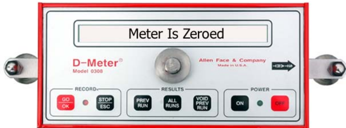
FIG 10 (reversed)